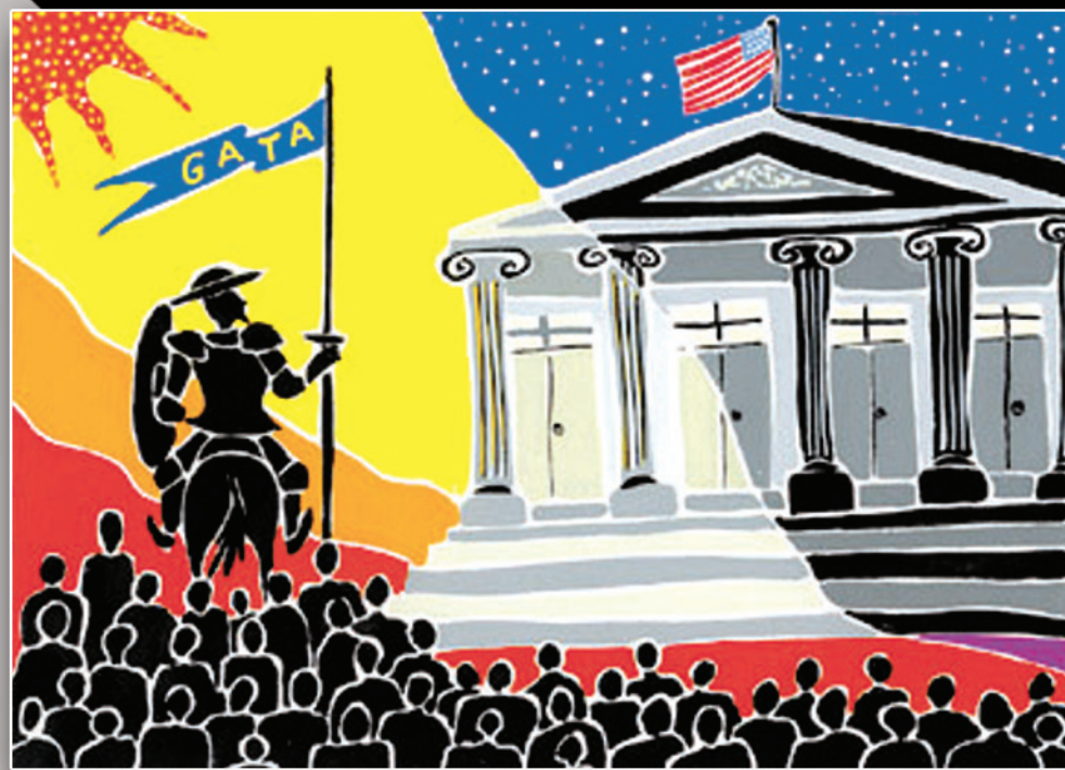
"GATA" by Alain Despert

The gold reserves of the United States have not been fully and independently audited for half a century. Now there is proof that those gold reserves and those of other Western nations are being used for the surreptitious manipulation of the international currency, commodity, equity, and bond markets.