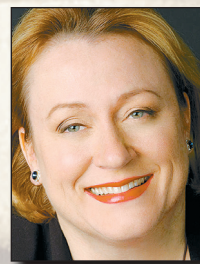
Catherine Austin Fitts

Portfolio manager for Holt & Shapard Capital Management LLC, St. Louis.